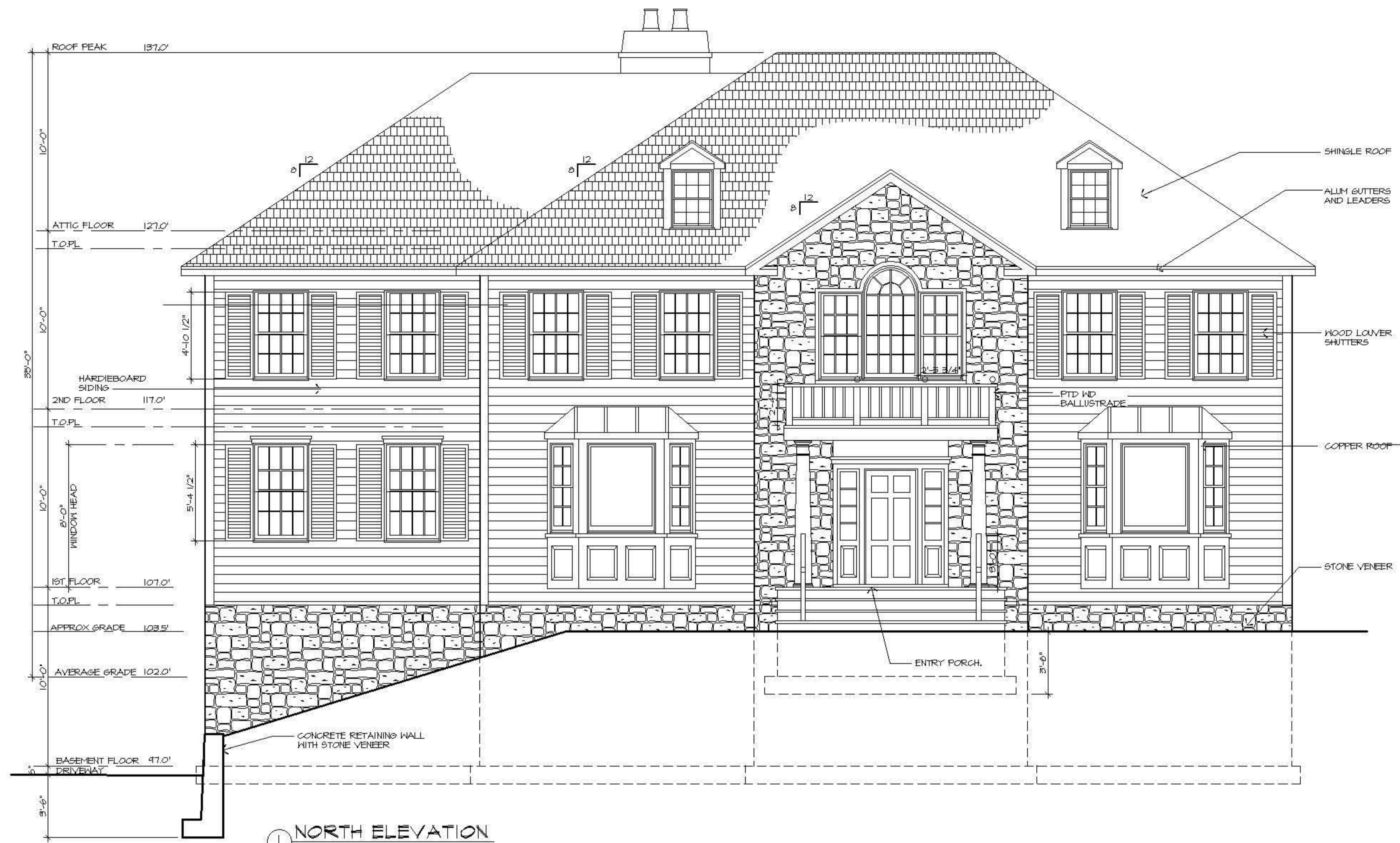
① NORTH ELEVATION SCALE: 1/4"=1'-0"