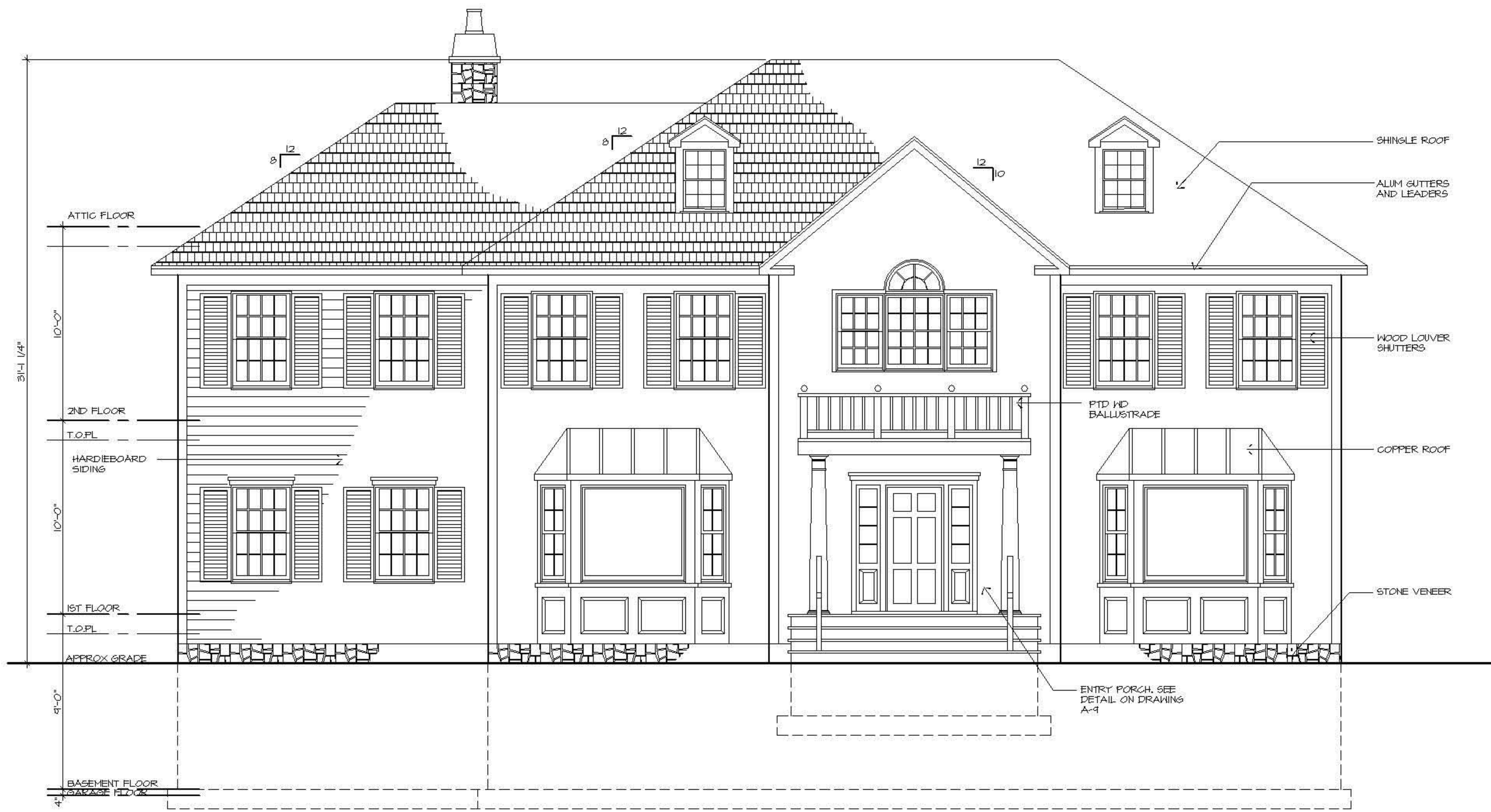
1 NORTH ELEVATION SCALE: 1/4"=1'-0"