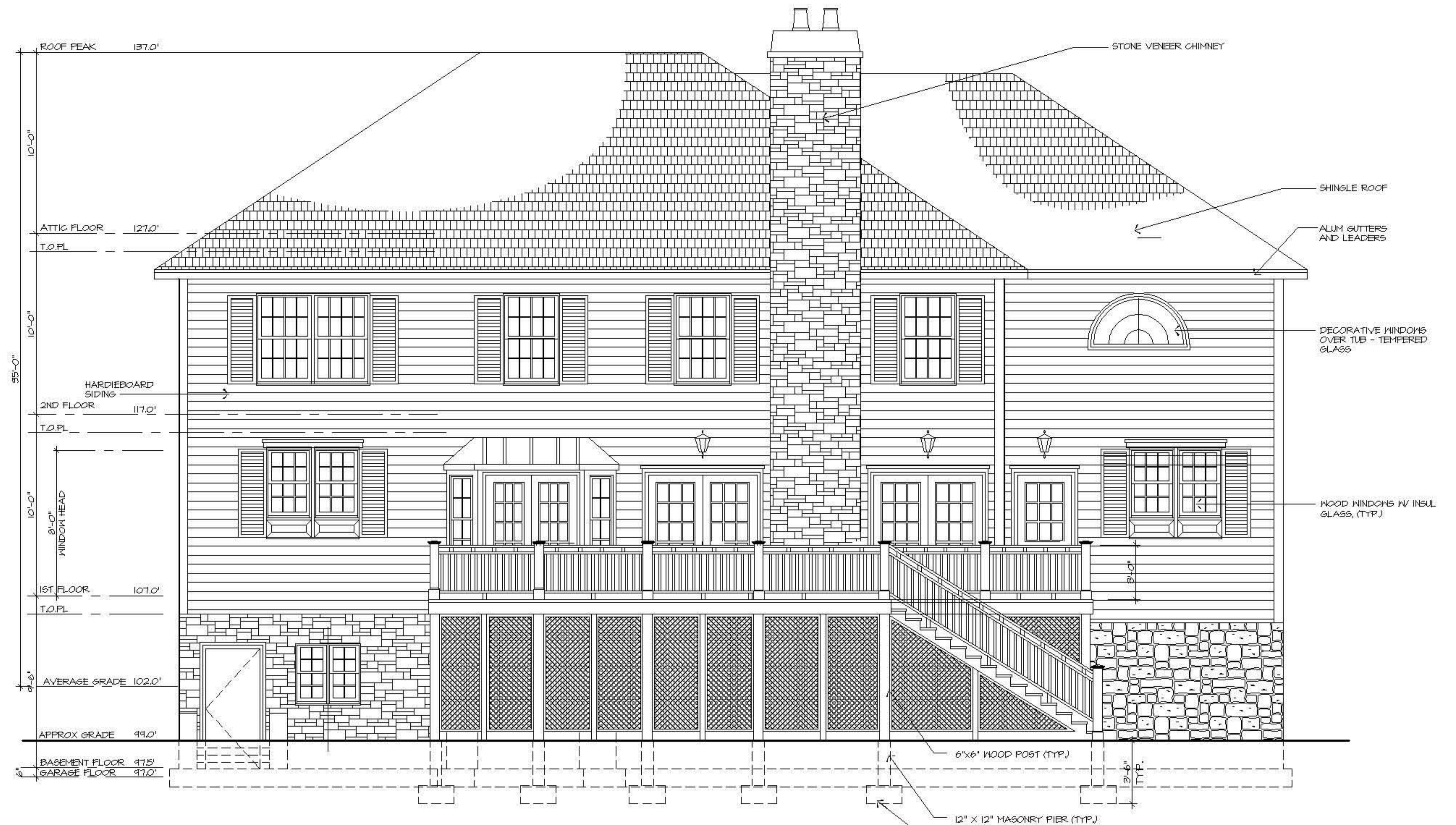
1 SOUTH ELEVATION SCALE: 1/4"=1'-0"